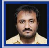
ANAND KUMAR Founder & CEO, Super 30