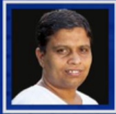
ACHARYA BALKRISHNA Chairman, Patanjali Ayurved