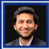
RITESH AGARWAL Founder & CEO OYO Rooms