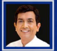
SANJEEV KAPOOR Indian Celebrity, Chef & Co-Founder Wonderchef